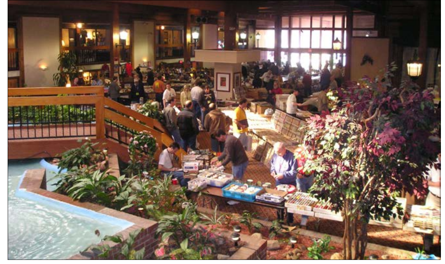
The indoor atrium of the Ramada Inn makes for a great trade floor. There is also an upper level in sections that fill up on Friday and Saturday. During the week room to room trading is virtually 24 hours a day.