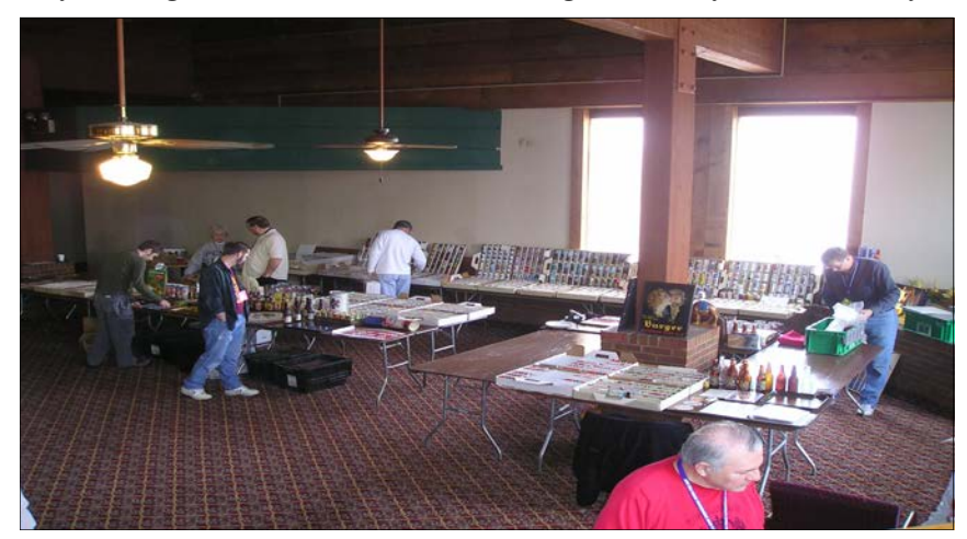
The upper level early on Saturday morning—usually brings in collectors from all over the East coast and the rest of the country.