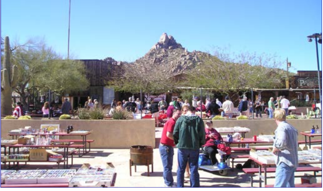
Above: Beautiful weather for an outdoor show saw the Pinnacle Peak mountain overseeing the days events. Below: Beer cans & cactus. Must be Arizona! Left & Right: The restaurant, homemade brews and the southwest atmosphere plus the A-1 Chapter's hospitality made for a memorable weekend.