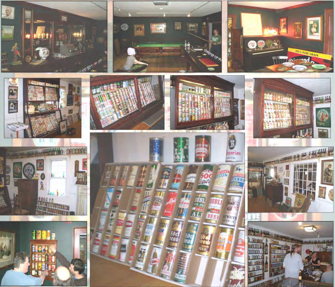
Above; Open house visitors from the Paper City Brewery– Pickwick show have lots to talk about and in just about. In every part of the display sections one can find cans and other items usually seen in reference books and in hobby lore. Wow! Want to see more? Log onto breweriana.com