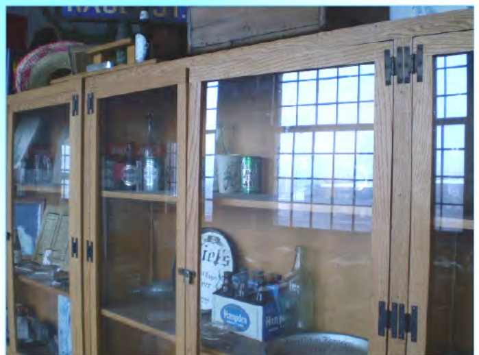
The Brewery's collection pieces displayed are a wide range of eastern breweriana, with a nice Bay State Ale.