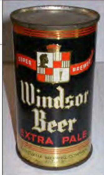
This Windsor Beer "extra pale" brand was produced by the legendary Manhattan Brewery of Chicago. Few survive today in grade 1+ condition.

The cans were an odd mix from the common to the scarce. First off, two beautiful condition foreign 12oz flat tops, a Tiger Lager from Singapore and a Tecate Cervesa, from Mexico. Next, some off-grade flat tops, but odd brands for the Indiana region, flats like Jay Vee, Gunthers Bock, Easy Life, Tivoli Bock and a Wilshire Club O/I. Also included,