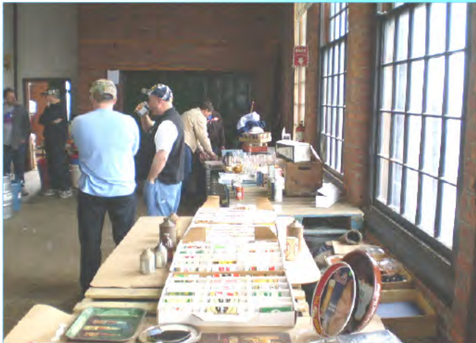
Several totes of great cans were on display for sale or trade and some quality serving trays from Narragansett.