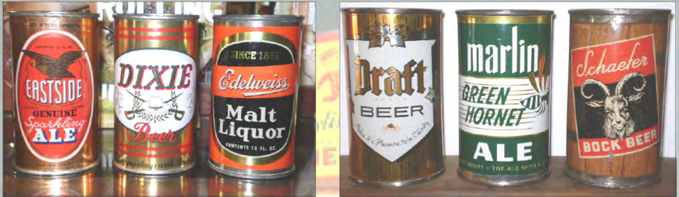
Above: Just a few examples of the quality cans available from the warehouse. These are some of the scarcest cans in the hobby in this condition. Below: Dan's rec-room is filled with all types of breweriana on display and for sale. Several rare pieces can be found at the bar display including miniature bottles, back bar items, trays, lithographs, outdoor steel signs, ball tap knobs, tip trays, foam scrapers, bottles, labels, openers and neons. What a concentration of specialized pieces not only available on the market but a tastefully displayed collection of some of the finest pieces in the collecting hobby!