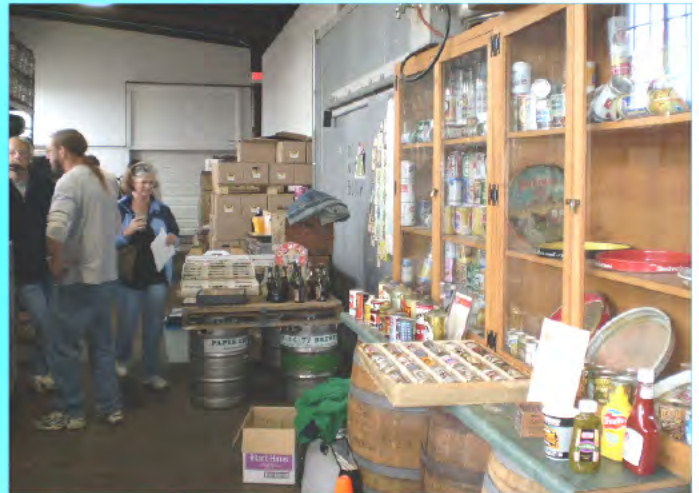
Makeshift tables of pallets and kegs, cabinets of collection pieces gave this show a unique atmosphere. A great time!