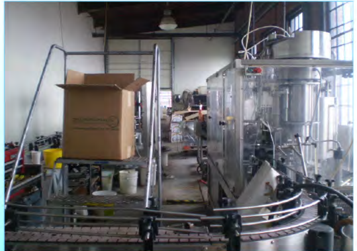
The Paper City Micro Brewery's bottling operations. Idol for the show, the brewery enjoys a loyal customer base.